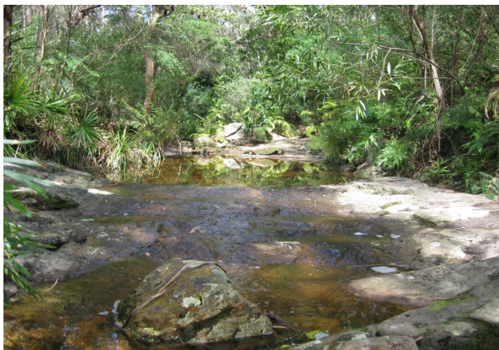
Delightful bush and waterways of the Illawarra escarpment