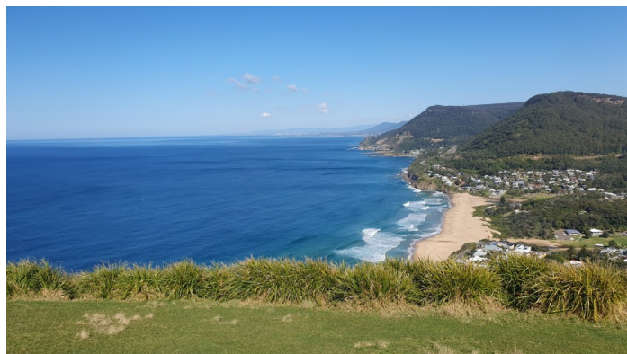
Illawarra escarpment south from Bald Hill

This brochure describes a section that can be completed as a medium to longish day walk and includes breathtaking escarpment and coastal views as well as bushland with high biodiversity.